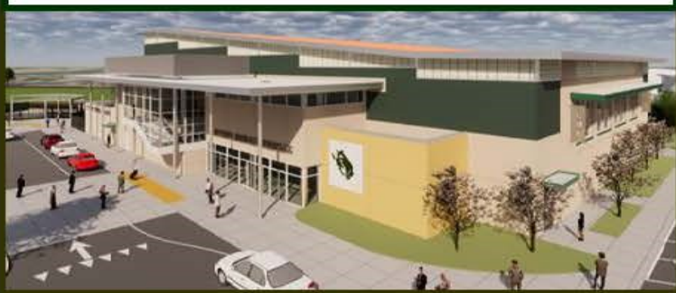
Livermore High Athletics & Aquatics Complex