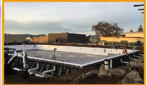
Granada High Pool Under Construction/Coming Soon