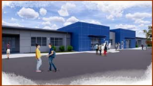
Joe Michell Classroom Building and Gym