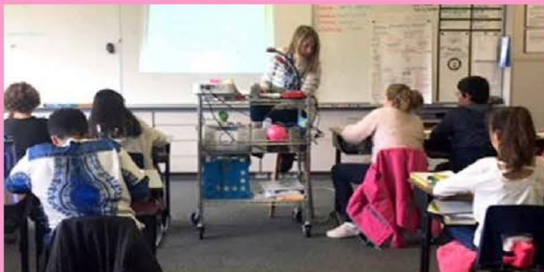
Districtwide Video Projection & Voice Enhancement Program