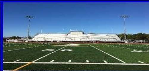
Livermore High School Stadium Improvements