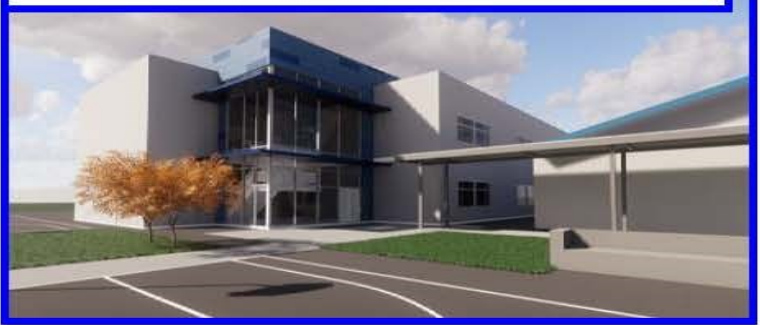
East Avenue New Classroom Building